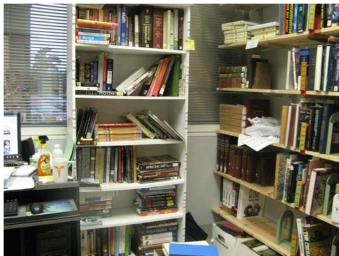
A view of the shelves containing the most popular Amazon books.

There are currently over 1200 books listed and shelved in order according to their probability of