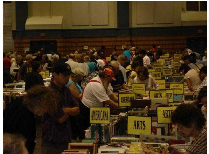
The "mad rush" on Thursday, the first morning of the book sale.

and breaking down the sale at its conclusion.