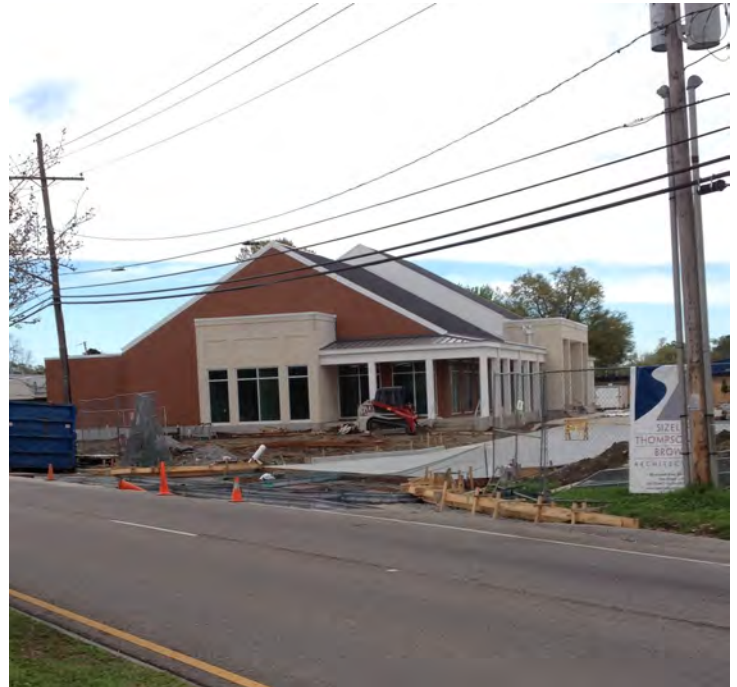
The soon to be completed River Ridge Library is located at 8825 Jefferson Highway.