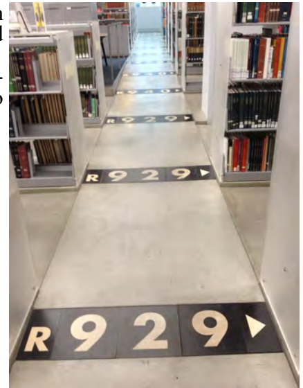
The reference area is part of the nonfiction spiral.

The nonfiction area is arranged in a spiral according to the Dewey Decimal System.