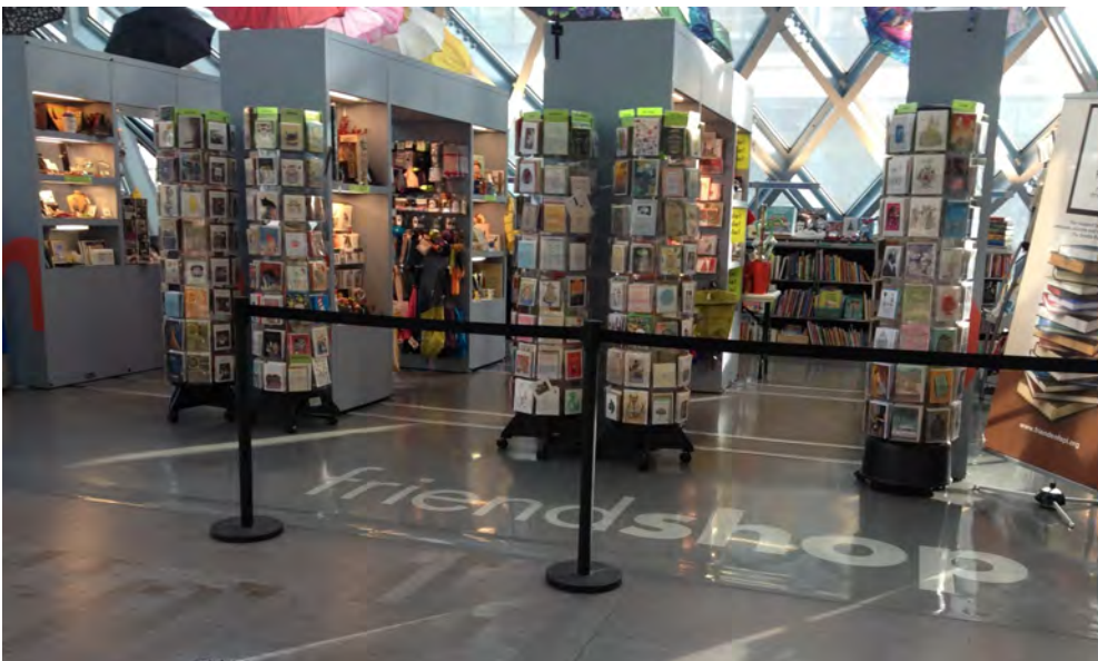
The Friends Store is very spacious.

The library opened in 2004 and comprises 363,000 square feet and 11 levels. It can hold more than 1.4 million books and provides 350 public computers with wireless Internet access. AND it includes a large Friends store!